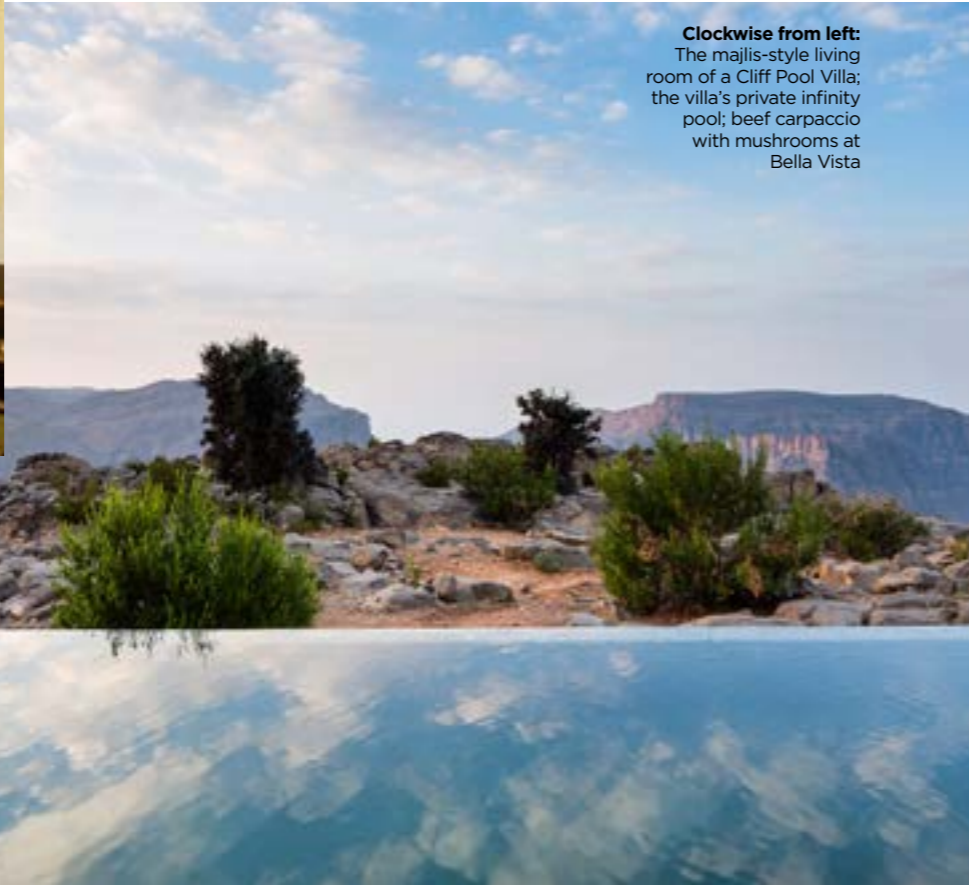
Clockwise from left: The majlis-style living room of a Cliff Pool Villa; the villa's private infinity pool; beef carpaccio with mushrooms at Bella Vista