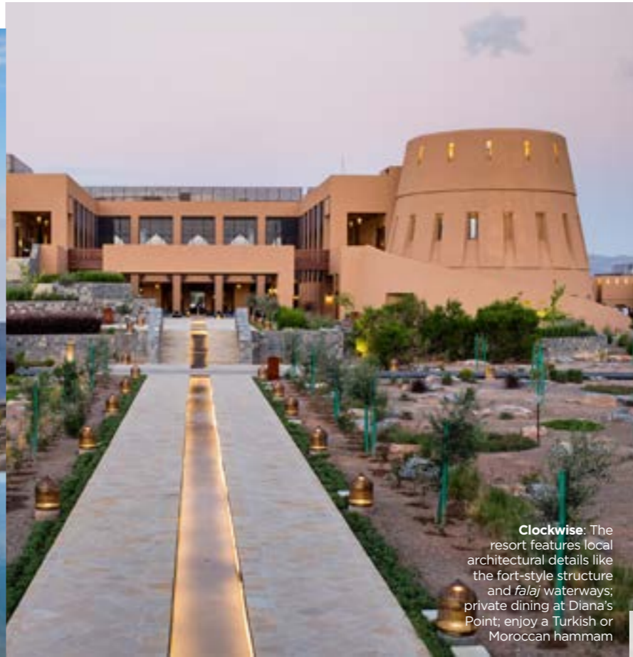
Clockwise: The resort features local architectural details like the fort-style structure and falaj waterways; private dining at Diana's Point; enjoy a Turkish or Moroccan hammam